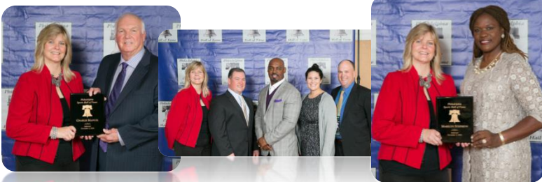
2016 Inductee Class

Join the ranks of Spike's our Flagship Sponsor and Preview Gallery Partner, as well as previous sponsors such as, Gatorade, Comcast-Spectacor, StubHub, Rothman Institute, Delaware Valley Packaging, the Phillies, Flyers, Eagles, Sixers, Villanova University, and many many more whom come back year after year to be part of this organization. With many levels of Sponsorship Available, and the ability to hand tailor a sponsorship package to suit any business, we are hopeful you will be able to partner with us for the 2017 Hall Year and in the future.