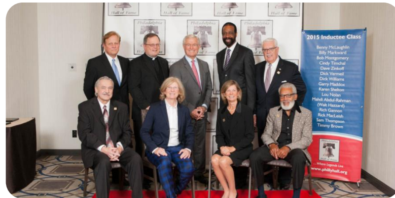
2015 Inductee Class