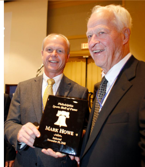
Mark and Gordie Howe after Mark's Induction